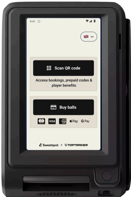
Select Scan QR Code