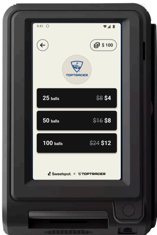
Choose basket size